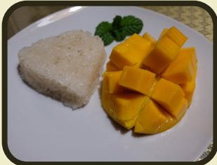
Mango and Sweet Sticky Rice