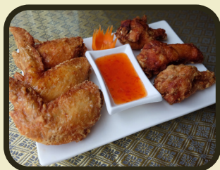
Thai Chicken Wings

Thai Chicken Wings (6) 8.95 Crispy wings marinated in Thai seasoning served with tangy Thai sauce.