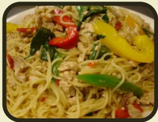
Thai Lo Mein