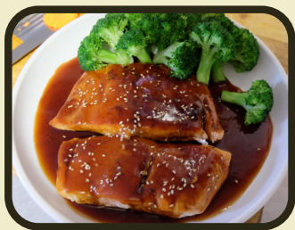
Salmon Teriyaki 20.95

The items below served with your choice of steamed Jasmine rice or Brown rice