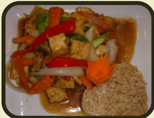
Pad Prik Pao

Sautéed fresh ginger, mushroom, bell peppers, onion, scallion and snow peas.